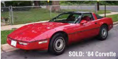
SOLD: '84 Corvette