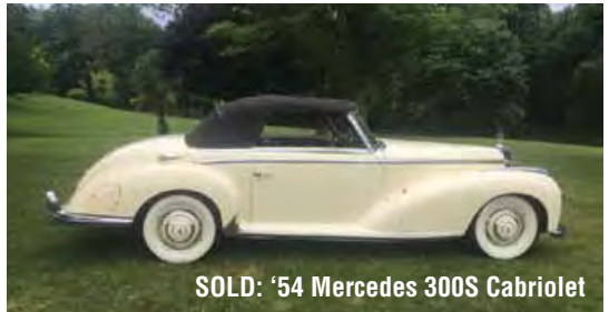
SOLD: '54 Mercedes 300S Cabriolet

Expertise in Sourcing & Promoting Vehicles Through Online Platforms & Auctions