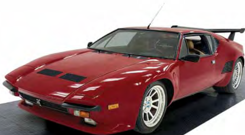
1986 DeTomaso Pantera GT5-S